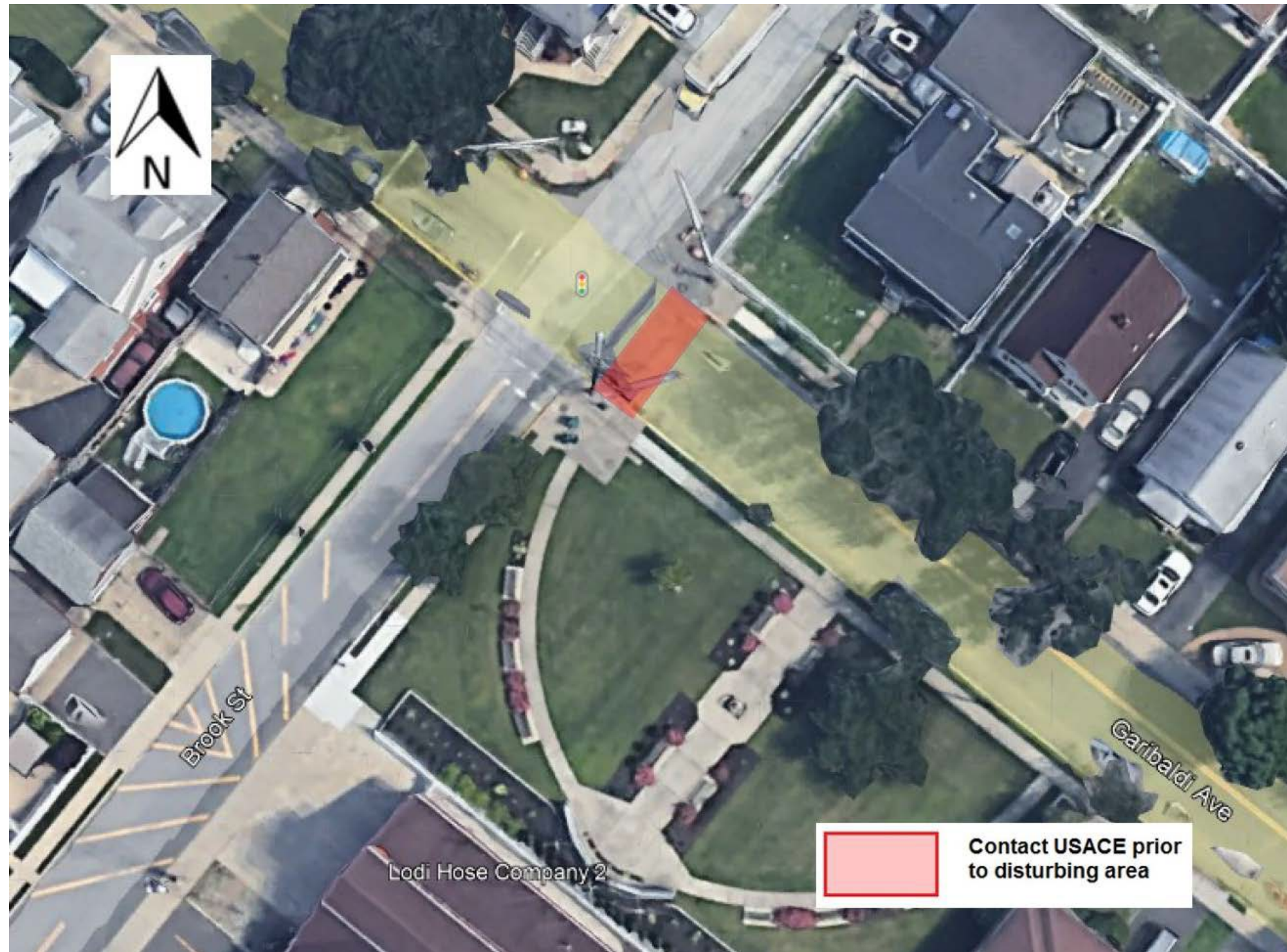
Figure 10 – Garibaldi Avenue