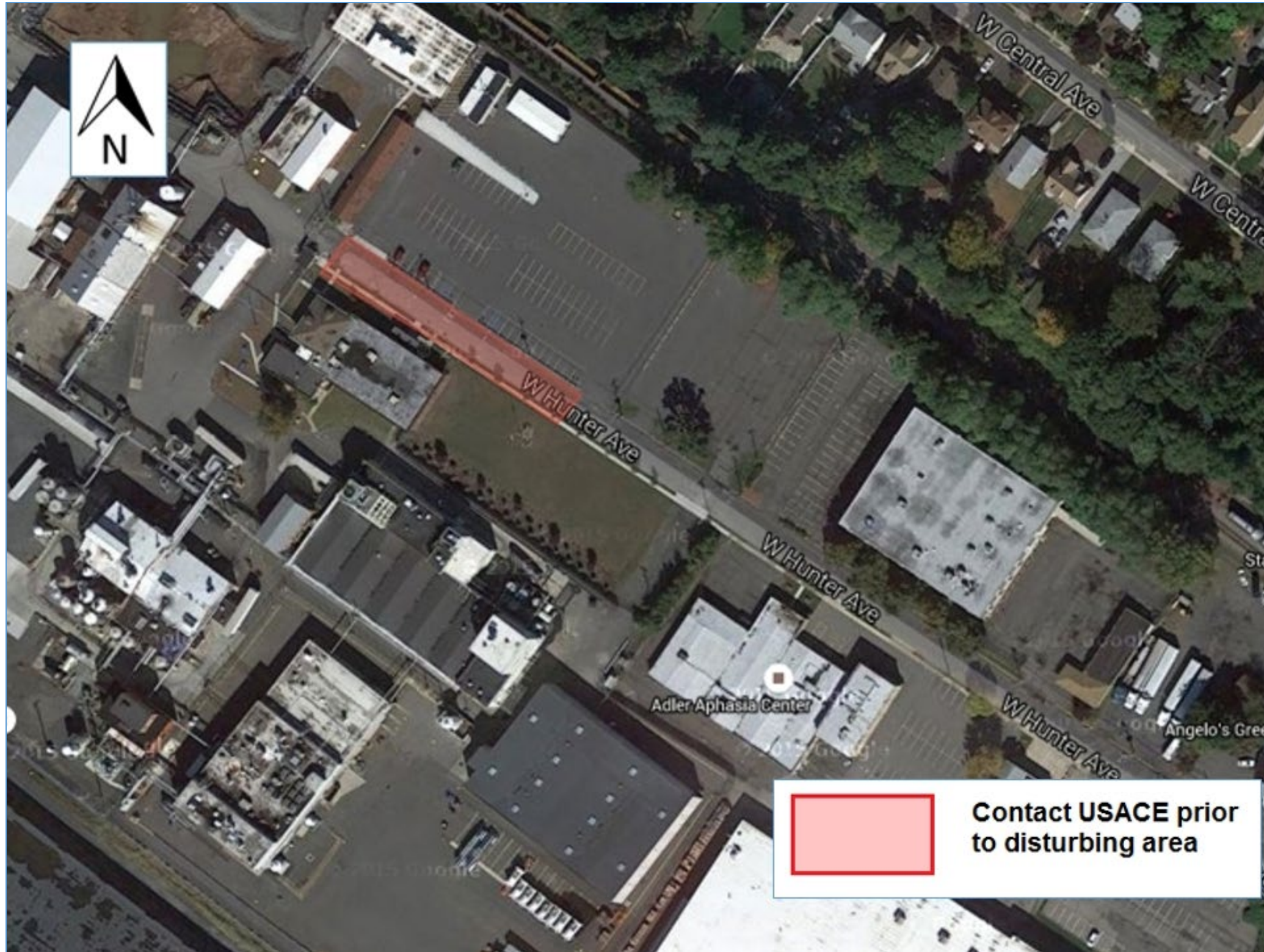
Figure 2 – West Hunter Avenue