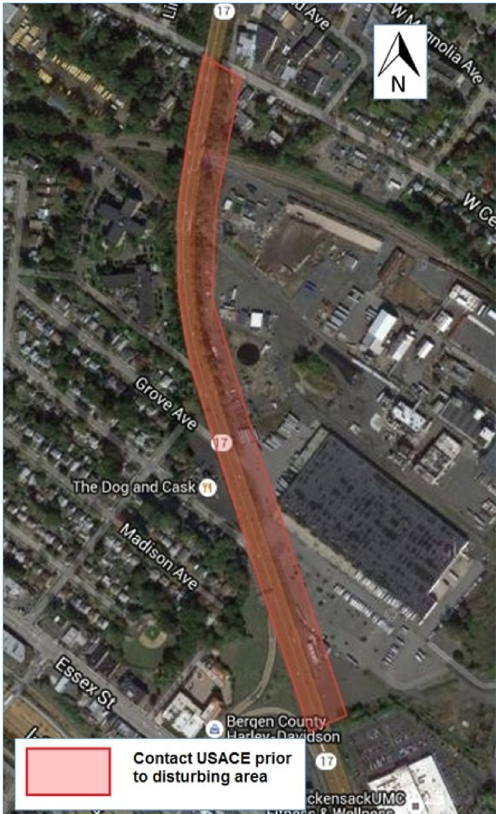
Figure 1 – New Jersey Route 17 and Williams-TransCo Natural Gas Pipeline