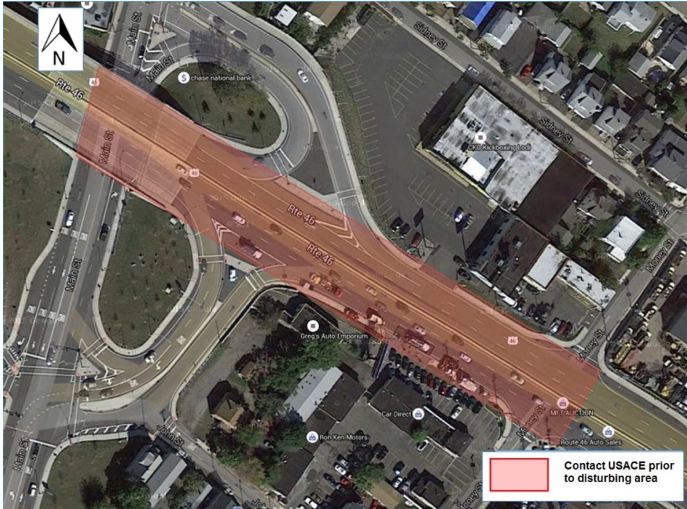
Figure 11 – U.S. Route 46