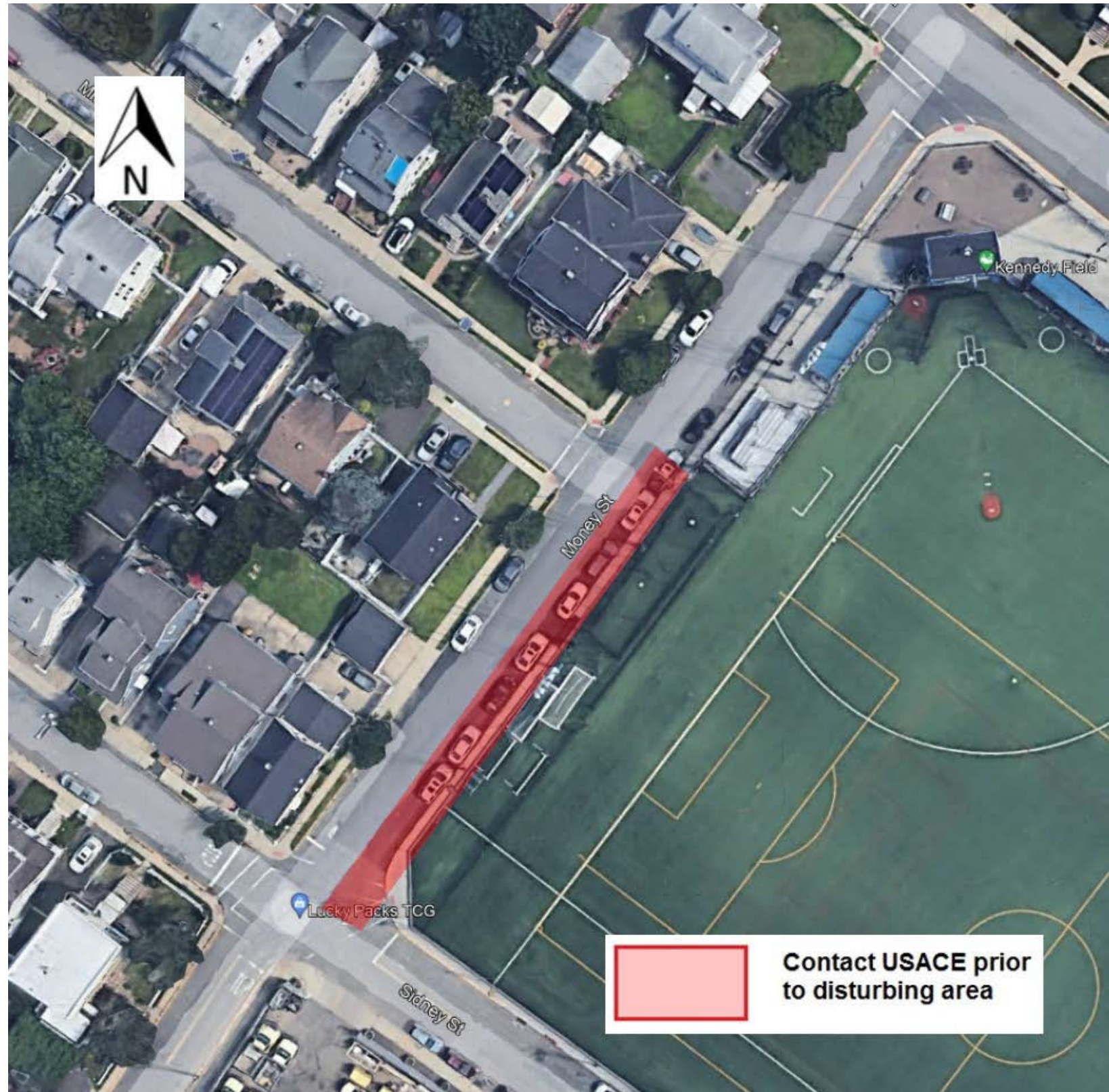
Figure 8 – Money Street